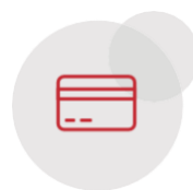
Credit Card Providers